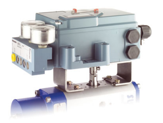
Example for mounting on rotary actuators.