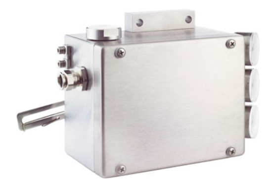
Optional Stainless Steel housing.